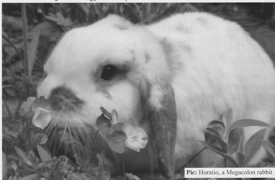
Pic: Horatio, a Megacolon rabbit

Prevention is the only, and best cure for Megacolon. Your quick actions, knowledge and close observation of your own rabbit are your best weapon for defeating it.