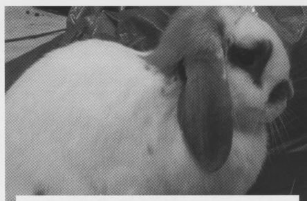
Pic: typical markings of a Megacolon rabbit

Some Megacolon rabbits who are severely affected often need an additional prokinetic drug like Metoclopramide or Domperidone to work on increasing appetite and emptying the contents of the stomach into the intestine. Sadly, owners can take an entrenched position saying they don't like giving medications unnecessarily. Who would? But Megacolon is a condition where long term drug use is essential to ensure a good quality of life for the rabbit and to