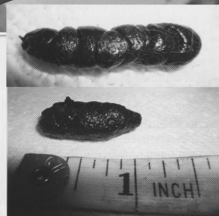
Right: sausage-like or tarry cecotrophs with a strong odour

still many vets out there resisting the proven fact that Megacolon exists in rabbits as it does in other animals and humans.