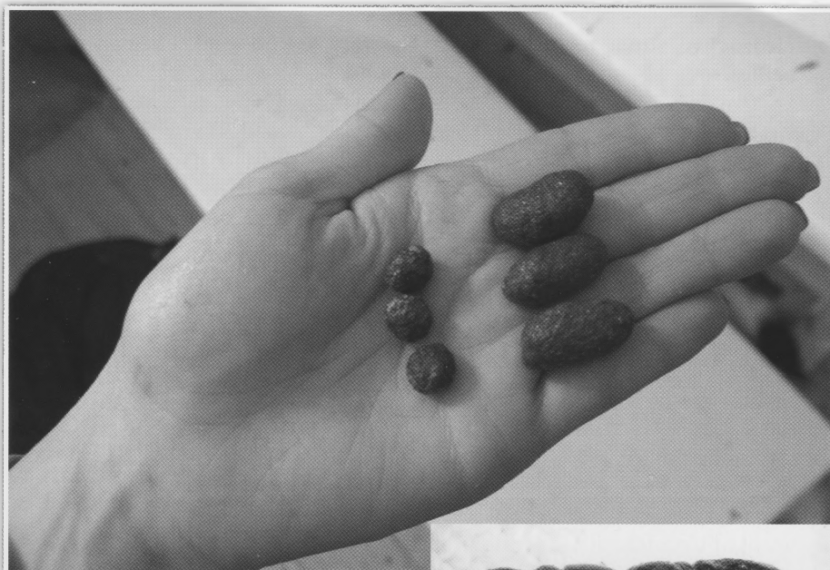
Above: An extreme case of Megacolon but shows the size and shapes the droppings can be.

But there was a major breakthrough for Megacolon rabbits in 2014 when the University of Bologna finally published their scientific study on the condition. Despite this, it can still be a struggle for owners and there are